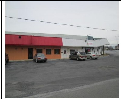
340 Pulaski /Quincy Ave (Building) Commercial 540-652-8769